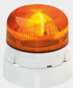
EXTERNAL MDG ALARM LIGHT