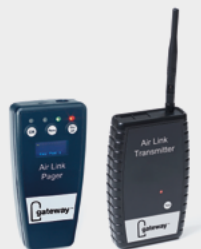
PAGER & TRANSMITTER