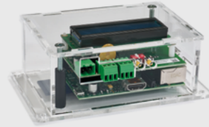
REMOTE SERVICE BASIC CONTROLLER BOX